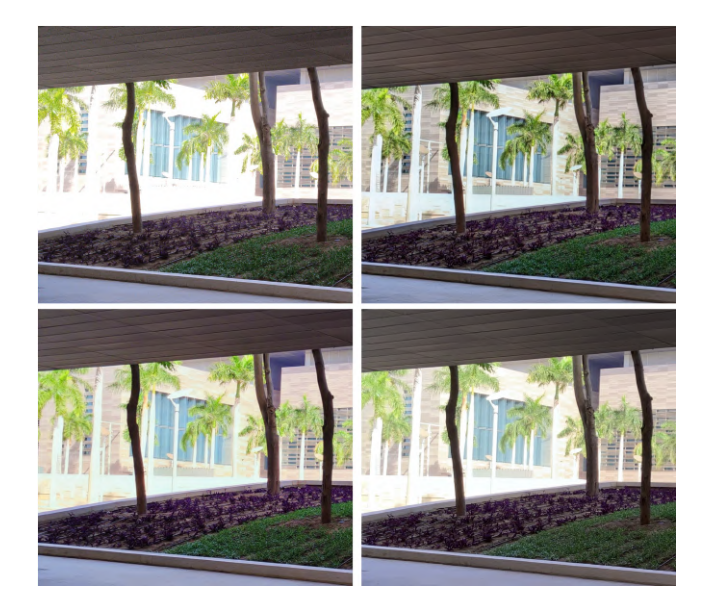
Figure 5: Zero-shot processing of images from new devices. MetaISP generating different interpretations from a Xiomi C40 input without additional training. Top-left Xiomi C40 (input, topright simulated Pixel 6 Pro, bottom-left simulated S22 Ultra, and bottom-right simulated iPhone XR. Please zoom in for more details.

RAW and device embedding as inputs. We also propose a novel idea to extract global semantics extra-patches and attention to account for global communication intra-patches.