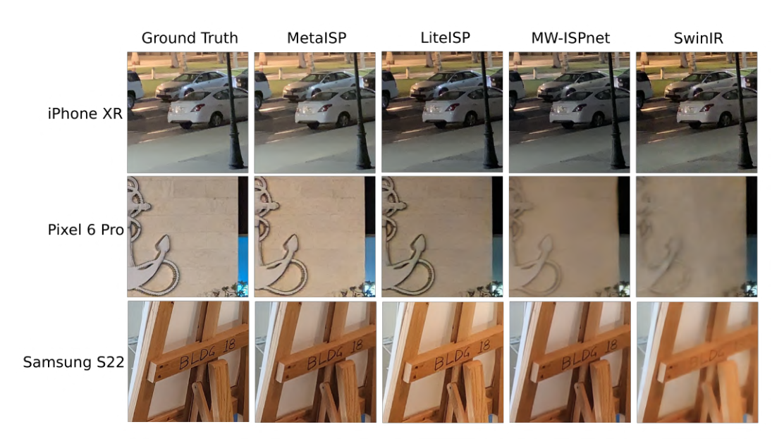
Figure 3: Patch-wise comparison between the different methods and the ground truth. The images mainly represent challenging scenarios, such as indoor and night scenes. Our model can accurately reproduce the color appearance of each target device. The alignment strategy described in the supplementary effectively avoids blurry effects that may be observed in SwinIR, resulting in sharper and more visually pleasing results. On the other hand, LiteISP does not suffer from blurry effects but struggles reproducing the color perception.

ISPNet [ITZ*20] lack a mechanism to compensate for misalignments in the dataset, resulting in blurry outputs. LiteISP [ZWL*21] has such feature, but it struggles with accurate color reproduction, which is crucial for reproducing the color rendition of mobile devices. Please check the supplementary material for more visualizations.