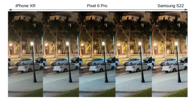
Figure 4: Here, we exemplify the possibility of interpolating be tween the embeddings of different devices generating intermediate images. We can notice how different ISPs understand the scene and put more emphasis on different features. We have iPhone XR, Pixel 6 Pro, and S22 Ultra from left to right.

cedure learns global semantics from a diverse set of scenarios provided by the monitor data, and the normalization adopted retains the statistics of this first process while training with real-world images. D is the addition of the attention mechanism as described in Section 2.1.3. This strategy enables the learning of global features within the patch and serves as a conditioning mechanism using the query vector from the embedding form of the device. Finally, E involves using the exposure time and ISO value to help control global light scene characteristics as described in Section 2.1.1.